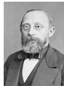
Rudolf L.K. Virchow 26